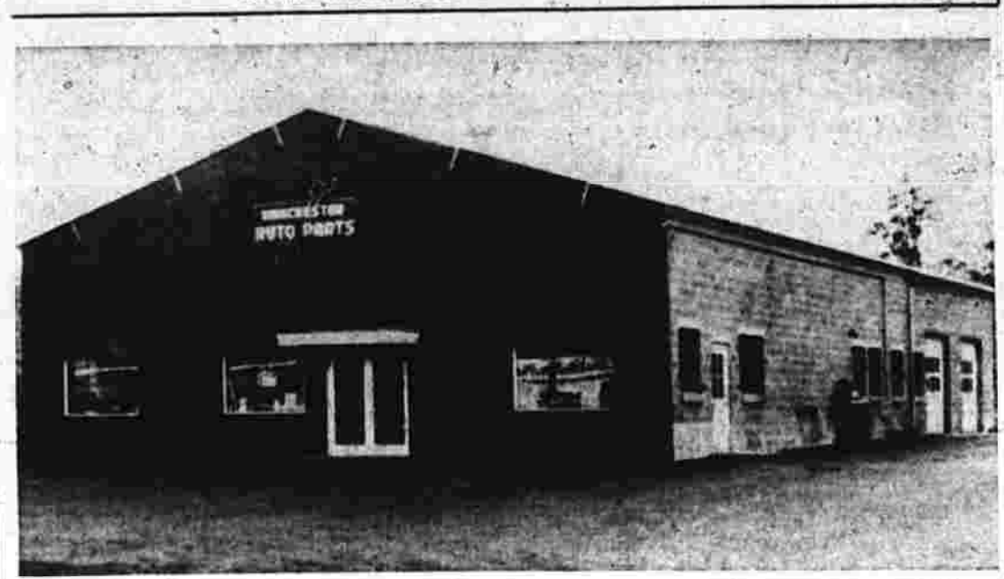
Manchester Auto Parts is now located in this new building at 270 Broad street. It is a Butler steel building with brick veneer front. A second floor is now being constructed inside and when completed will provide a total 70,000 square feet of floor space.